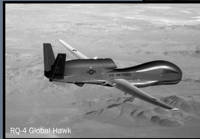
RQ-4 Global Hawk

Wright-Patterson AFB Robins AFB Waco, TX Greenville, TX Denver, CO