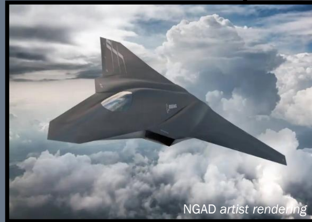
NGAD artist rendering