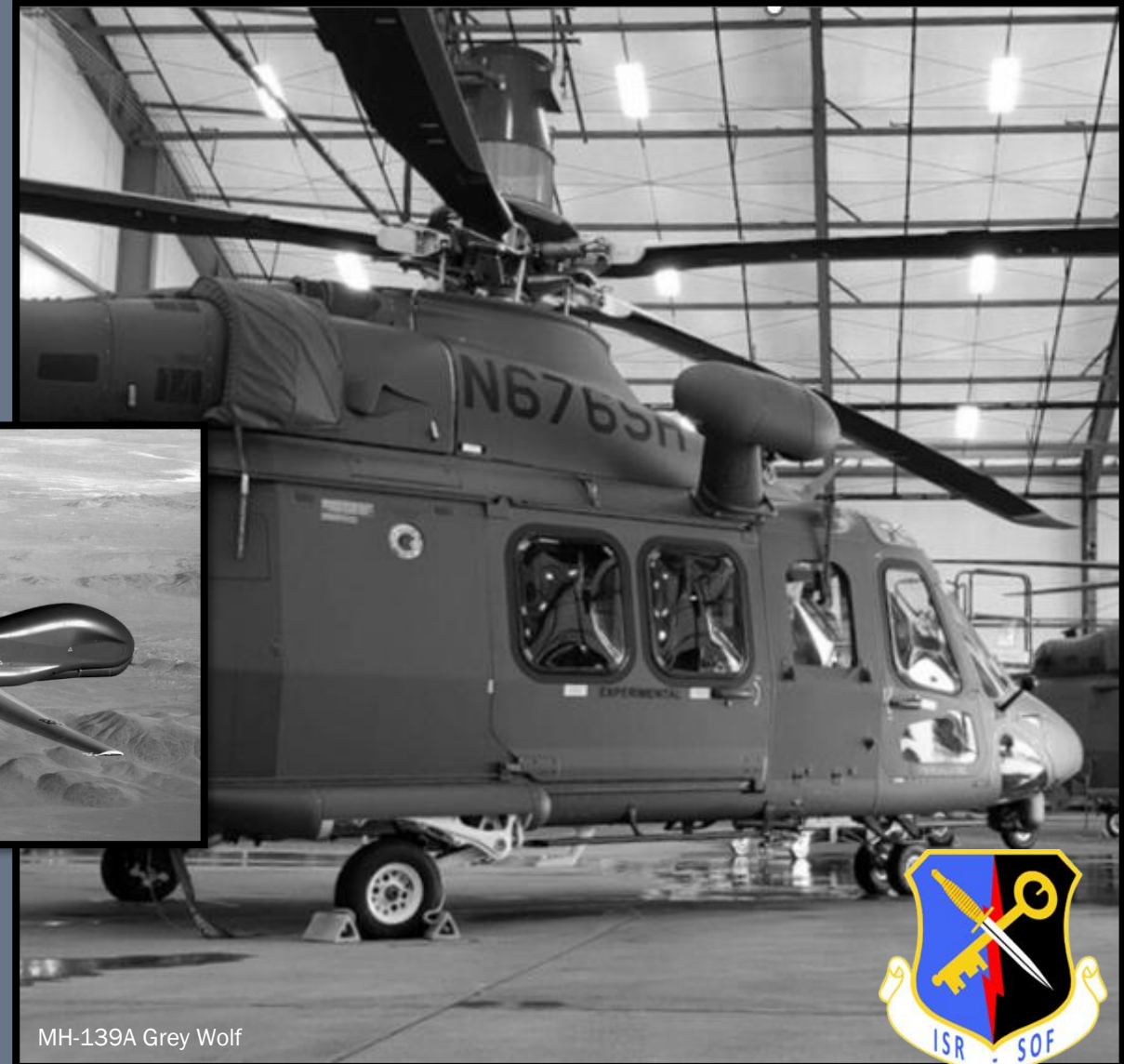
MH-139A Grey Wolf