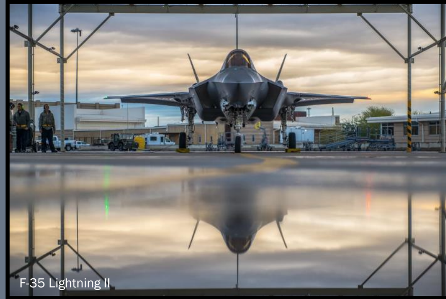
F-35 Lightning II

Arlington VA Wright-Patterson Air Force Base