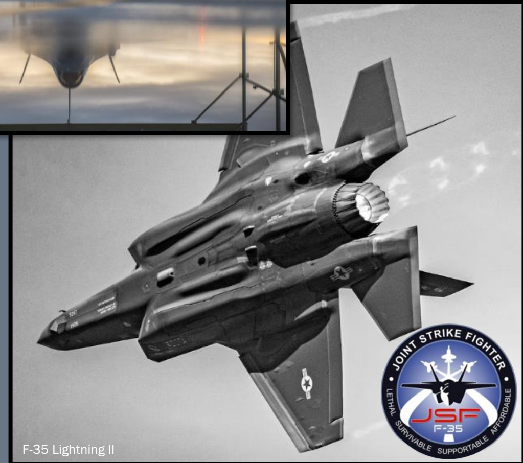
F-35 Lightning II